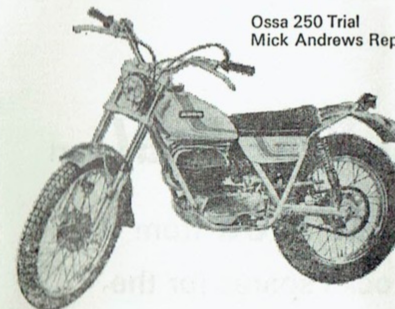
Ossa 250 Trial Mick Andrews Replica