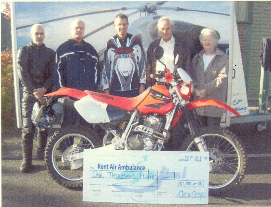
The helicopter was on a 'shout', so we stood in front of their publicity trailer.....