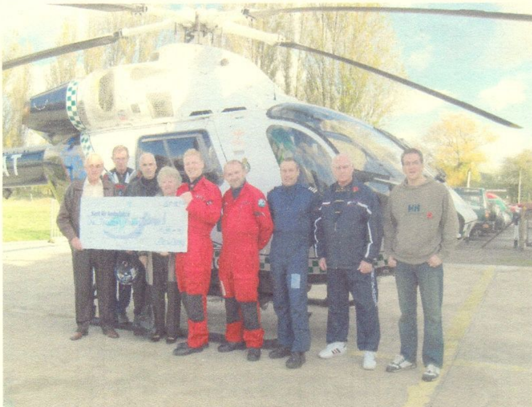
.....but it returned, so we did the job properly with the crew.