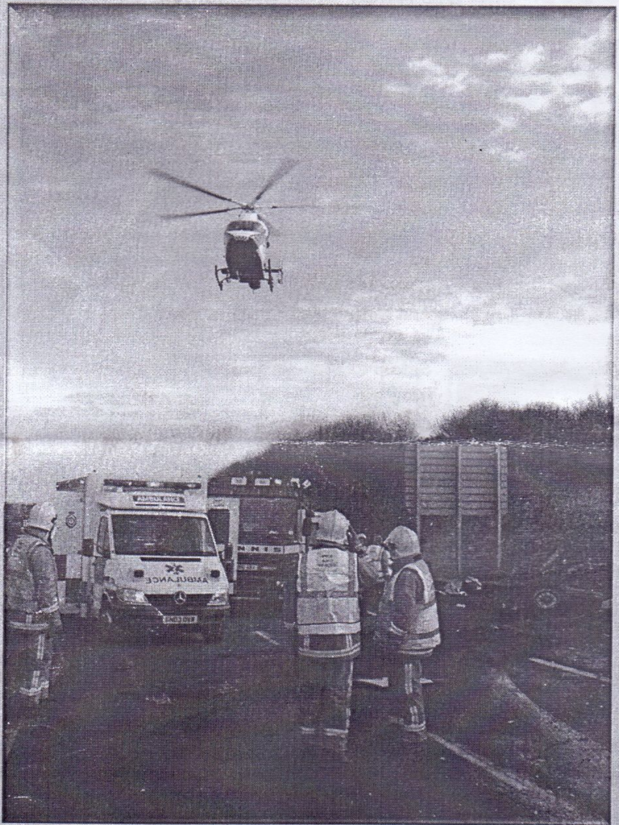
This picture says a thousand words!