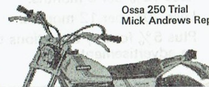
Ossa 250 Trial Mick Andrews Replica