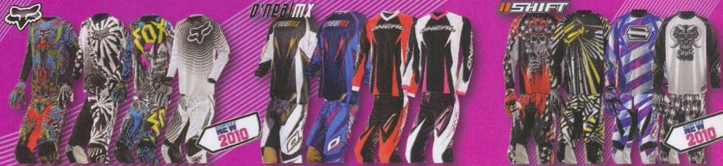
FOX 2010 RACE KITS

FOR ALL THE BEST PRICES ON CLOTHING, PARTS AND ACCESSORIES CALL 01782 338738 OR VISIT US AT WWW.DKOFFROAD.CO.UK