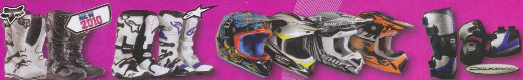
FOX 2010 RACE BOOTS