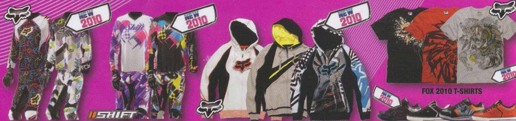
LADIES FOX 2010 RACE KITS