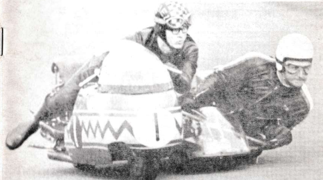
GUESS WHO?