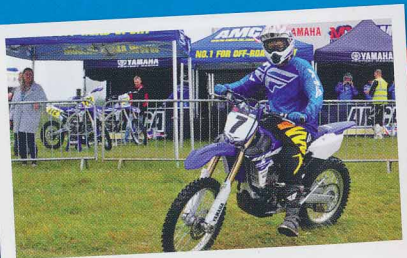
I learnt loads and loved every minute...

VISIT YAMAHAMXEXPERIENCE.CO.UK CALL 01543 466282