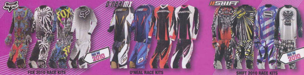
FOX 2010 RACE KITS

FOR ALL THE BEST PRICES ON CLOTHING, PARTS AND ACCESSORIES CALL 01782 338738 OR VISIT US AT WWW.DKOFFROAD.CO.UK