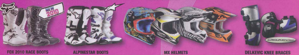
FOX 2010 RACE BOOTS