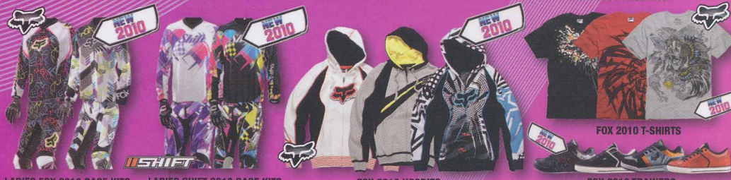
LADIES FOX 2010 RACE KITS