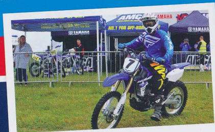
I learnt loads and loved every minute...