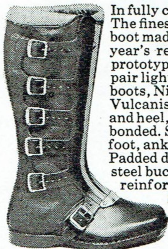
DODINGTON MODEL 7403

In fully chromed Ox hide. The finest Moto-Cross boot made after a whole year's research and prototype trials. 2 lbs. per pair lighter than other boots, Nitrile Direct Vulcanised Slipper sole and heel, indestructibly bonded. Sponge padded foot, ankle and shin area. Padded dust excluder, six steel buckles, and reinforced toe. Sizes 5-12.