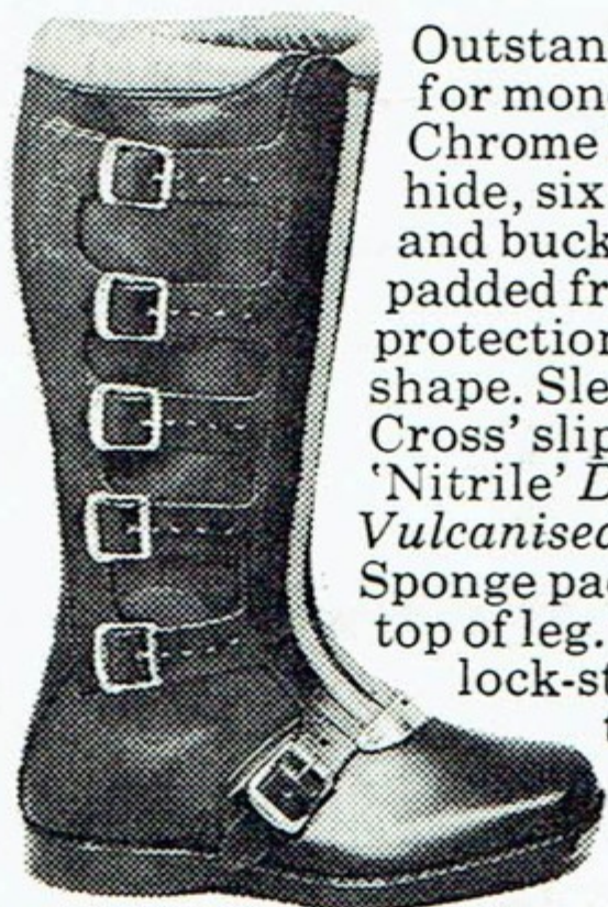
Red Devil Model 7406 Mk2

Outstanding value for money. 2½ mm Full Chrome English Ox hide, six stout straps and buckles. Sponge padded front for skin protection. Smart toe shape. Sleek 'Moto-Cross' slipper sole of 'Nitrile' Directly Vulcanised to upper. Sponge padded cuff at top of leg. 'Terylene' lock-stitched throughout.