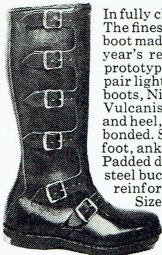
Dodington Model 7403

Outstanding value for money. 2½ mm Full Chrome English Ox hide, six stout straps and buckles. Sponge padded front for skin protection. Smart toe shape. Sleek 'Moto-Cross' slipper sole of 'Nitrile' Directly Vulcanised to upper. Sponge padded cuff at top of leg. 'Terylene' lock-stitched throughout.