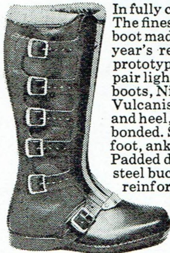
DODINGTON MODEL 7403

In fully chromed Ox hide. The finest Moto-Cross boot made after a whole year's research and prototype trials. 2 lbs. per pair lighter than other boots, Nitrile Direct Vulcanised Slipper sole and heel, indestructibly bonded. Sponge padded foot, ankle and shin area. Padded dust excluder, six steel buckles, and reinforced toe. Sizes 5-12.