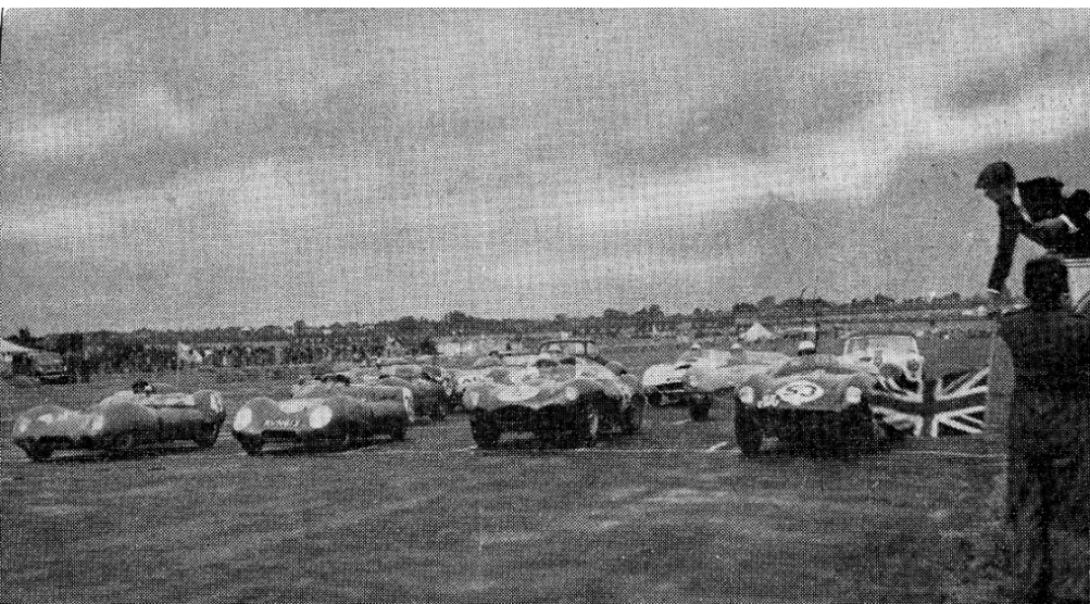
Start of the over 1500cc Sports Car race

meeting had been a success, with Autosport's reporter commenting " For a first attempt it was extremely well handled and well supported ".